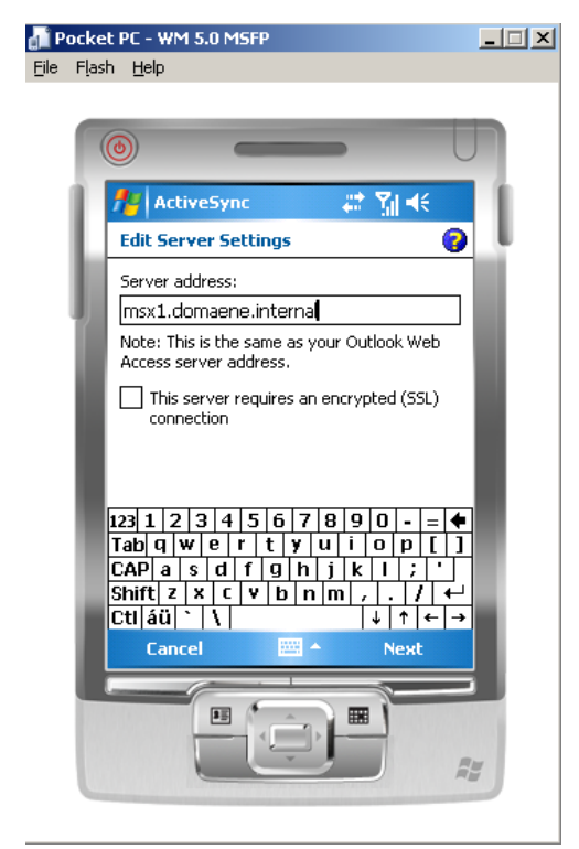
Figure 10: Configure a ActiveSync connection

Enter the DNS Name of the Exchange Server. It is highly recommended using a SSL connection between the Mobile Device and the Exchange Server but I only wanted to demonstrate you the new Device Emulator Functionality so I created a non SSL session.