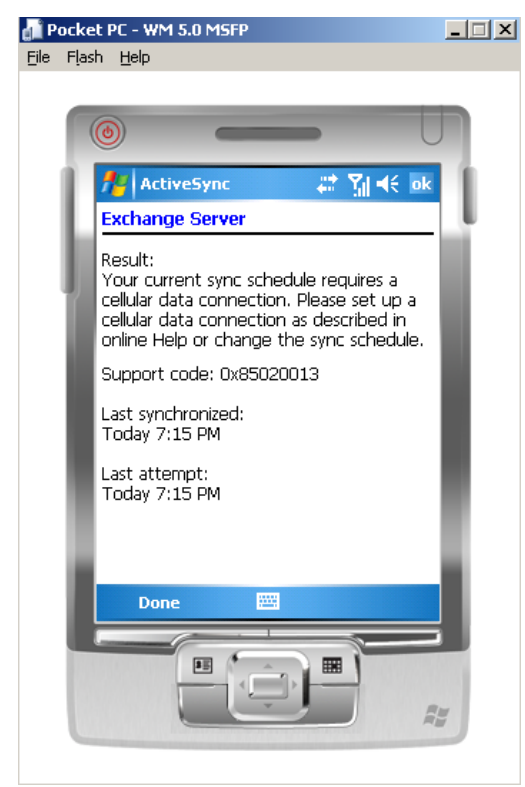
Figure 3: Device Emulator Error Message

Read and accept the License Agreement and click Install.