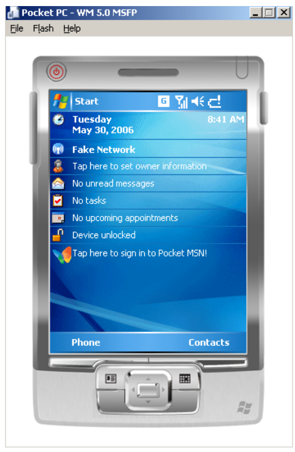
Figure 7: Pocket PC Phone with Windows Mobile 5.0 and MSFP

After that you can use the Device Emulator. The following picture shows the Pocket PC Phone Emulator with Windows Mobile 5.0 and MSFP.