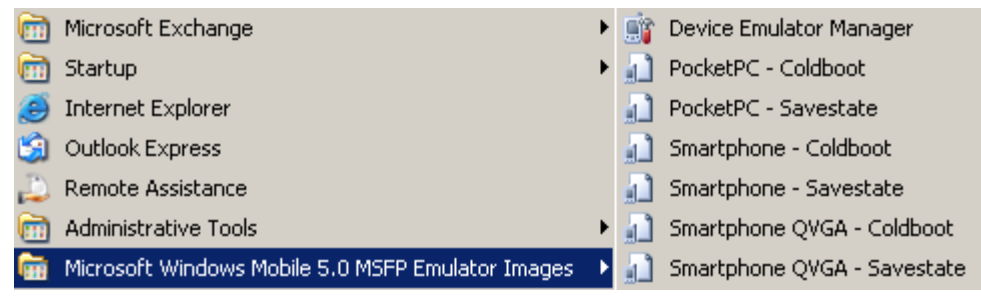
Figure 6: Select a Device Emulator Manager Image

After installation you can open a Device Emulator Image.