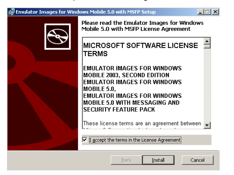
Figure 4: Installing the Emulator Images for Windows Mobile with MSFP

Read and accept the License Agreement and click Install.