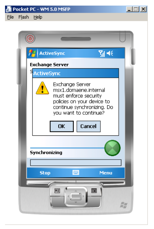
Figure 9: First contact of the mobile device

If you use the Mobile Security Settings in the Exchange System Manager from SP2, at the first contact of your mobile device, it must enforce Security settings to the mobile device.