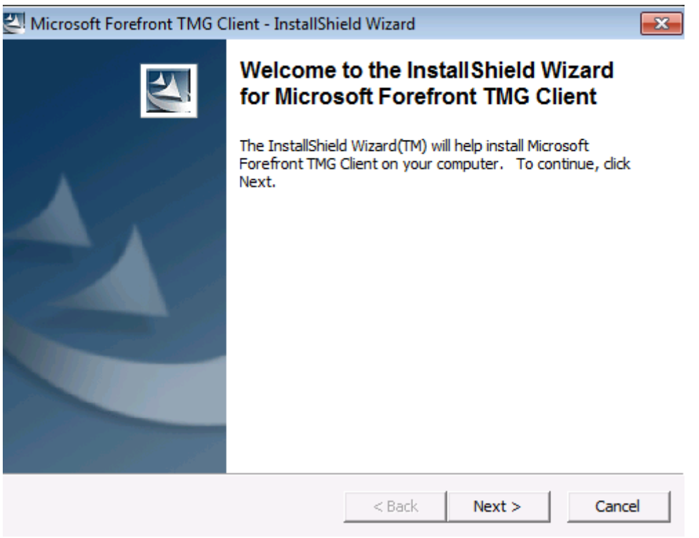
Figure 3: Installation of the TMG client

Start the installation process and follow the instructions of the wizard.