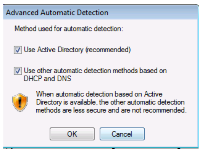
Figure 5: Advanced Automatic Detection

If you want to modify the behaviour of the automatic detection process, the TMG client has now a new options to define the method used for automatic detection.